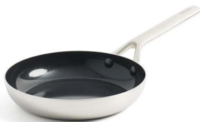
平底煎鍋 20厘米 FRYPAN 20 CM