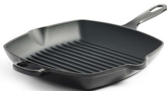
平底烤盤 26厘米 CAST IRON GRILL PAN 26 CM

15 個 PCS ROYAL + $199 1000 分 PTS + $209 VIP 5000 分 PTS + $109