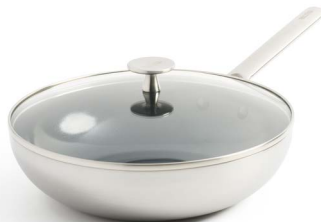
配蓋炒鍋 28厘米 | 3.6公升 WOK WITH LID 28 CM | 3.6 L